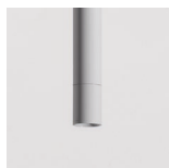
07 wrinkled white RAL 9016