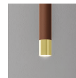
13 rust brown wrinkled final polished gold